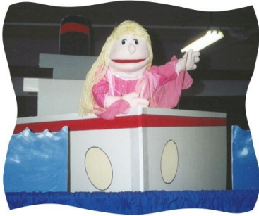
God's Love is so big, it's "Titanic"!

After a 3-week hiatus (to get a handle on the parenting thing), we resumed practices and finished off our year with a message for young and old alike on the theme of "God's Love". All the Calvary Temple Sunday school departments from pre-school to junior high attended. We have found that performing in the gym can give us the space to accommodate multiple groups and that will allow for everyone to enjoy the shows. We were even able to sneak in a little "puppy show" just for the pre-schoolers in the midst of winding up our year.