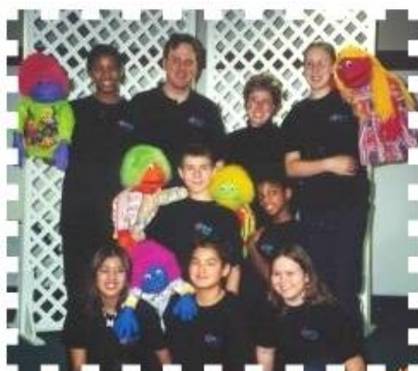
Puppets 4 Him

Hooray! Summer at last! And, yes, with it comes the inevitable ... garage sales, mosquitoes and the Puppets 4 Him newsletter! Okay, so maybe we shouldn't bring up the part about the mosquitoes, but we're just itching to tell you all about our puppet year we just wrapped up!