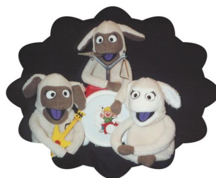
The "Baa Sheep Boys" made an encore presentation at Christmas.