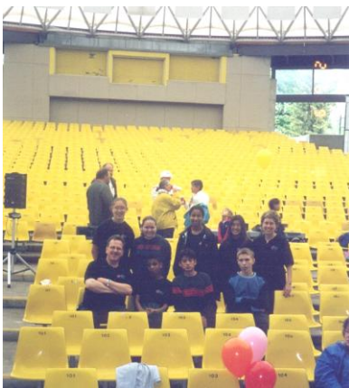
Somewhere under the rainbow!

After a 3-week hiatus (to get a handle on the parenting thing), we resumed practices and finished off our year with a message for young and old alike on the theme of "God's Love". All the Calvary Temple Sunday school departments from pre-school to junior high attended. We have found that performing in the gym can give us the space to accommodate multiple groups and that will allow for everyone to enjoy the shows. We were even able to sneak in a little "puppy show" just for the pre-schoolers in the midst of winding up our year.