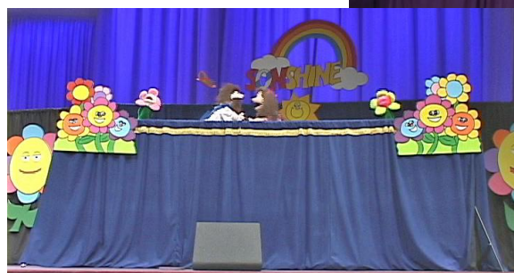
Livin' on Sonshine