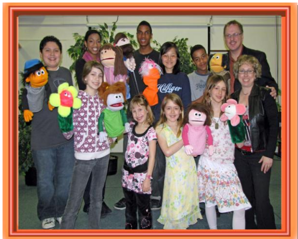
Puppets 4 Him