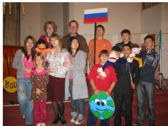
Russian Puppet Team: "Step by Step"