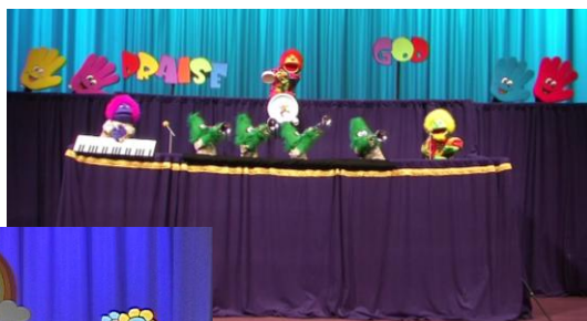
Praise God Tonight

"Jukebox Joe", the latest addition to our puppet collection, is a black light puppet who was custom made in Louisiana. He made his debut at Family Fun Day in June.