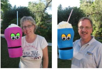
Pleased with the end result in some of the hands-on workshops!