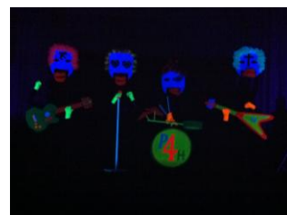
“Praise the Lord All Night”

Our Sunday mornings were usually spent practicing, practicing, practicing, but we had a number of occasions when we were able to puppetize a few songs as a group and have some prop painting sessions. We were pleased to have the opportunity to present some country-themed songs a number of times in Sunday School and Godzone. By May, we felt that the family worship service was ready for our larger-than-life blacklight Kiss parody, “Praise the Lord All Night”!! We sure worked on that one a long time to get it just right! Our final presentation of the year, “Happy in Jesus”, was a lot of fun. How can you go wrong with a bus load of 70’s shepherds and singing sheep! That one really had our wheels turning, in more ways than one! With busses and life-size guitars and drum sets, it’s no wonder we are quickly outgrowing our prop storage area!