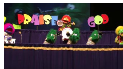
Praise God Tonight