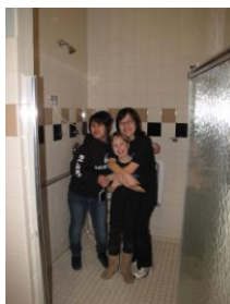
Could THIS have been where Justin Beiber showered?